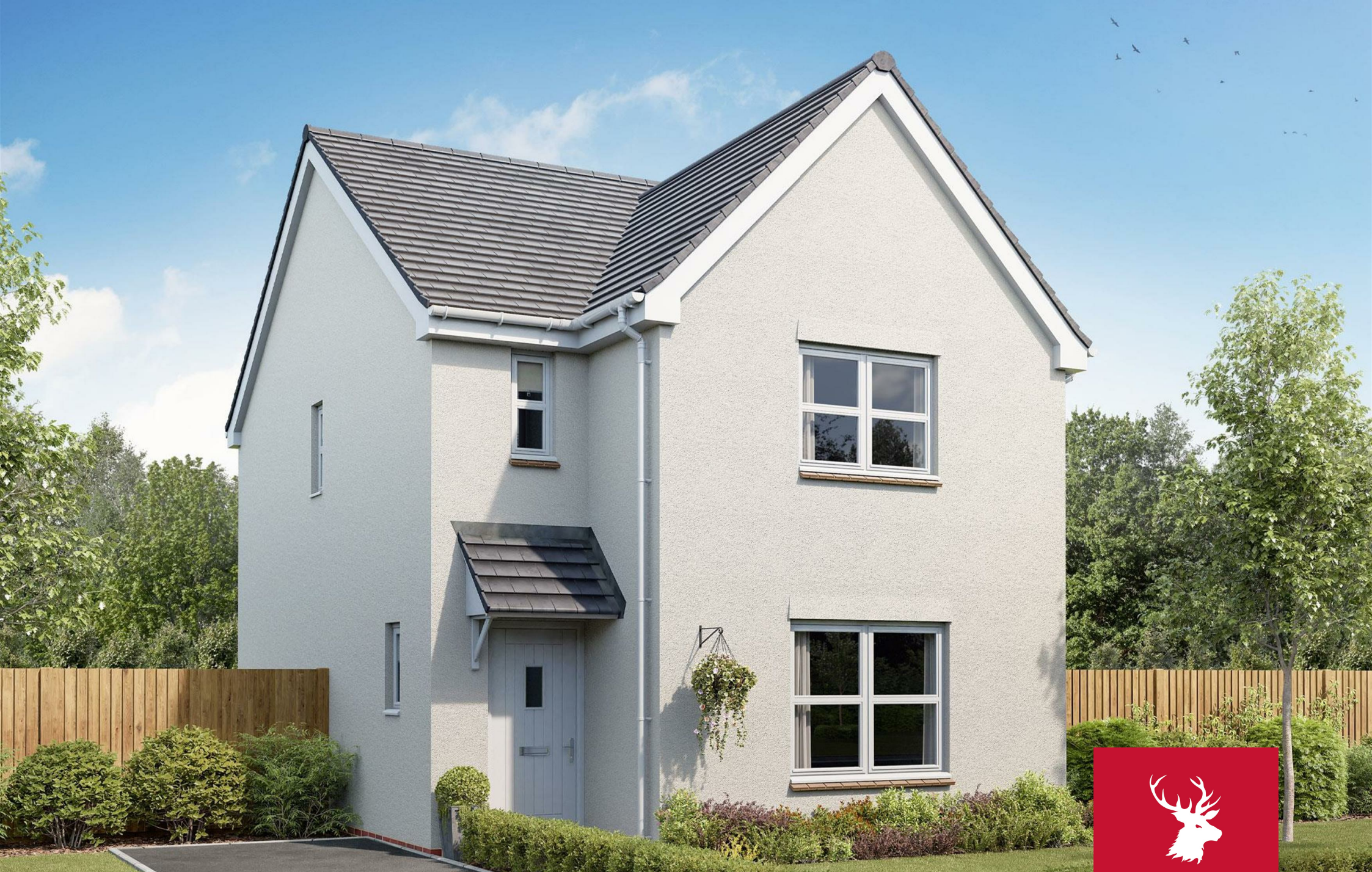
Plot 116 Abbotsham Park