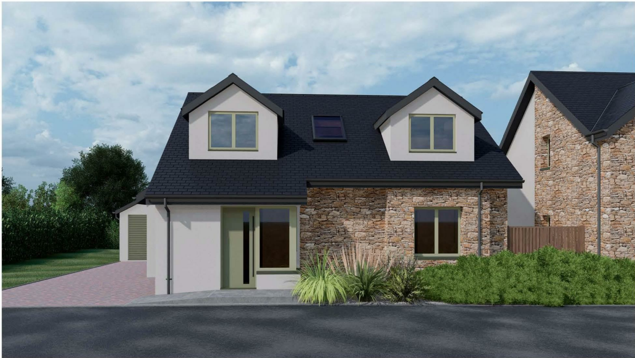
1429 3D VISUALISATION 08