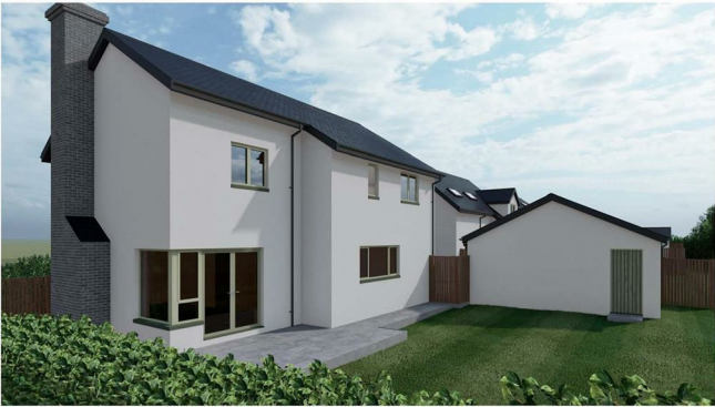
1429 3D VISUALISATION 03