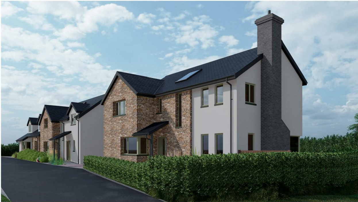
1429 3D VISUALISATION 01