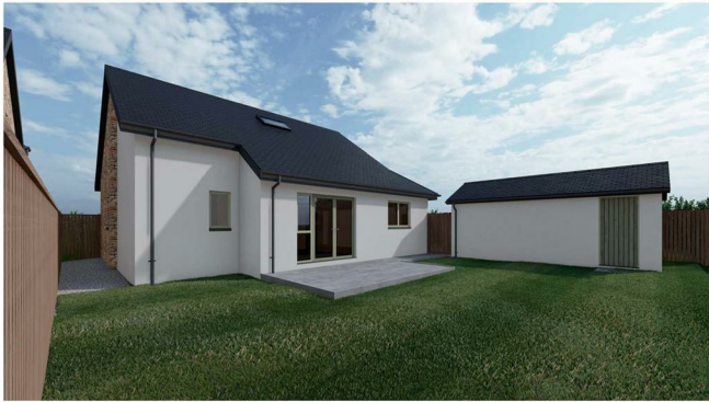
1429 3D VISUALISATION 10