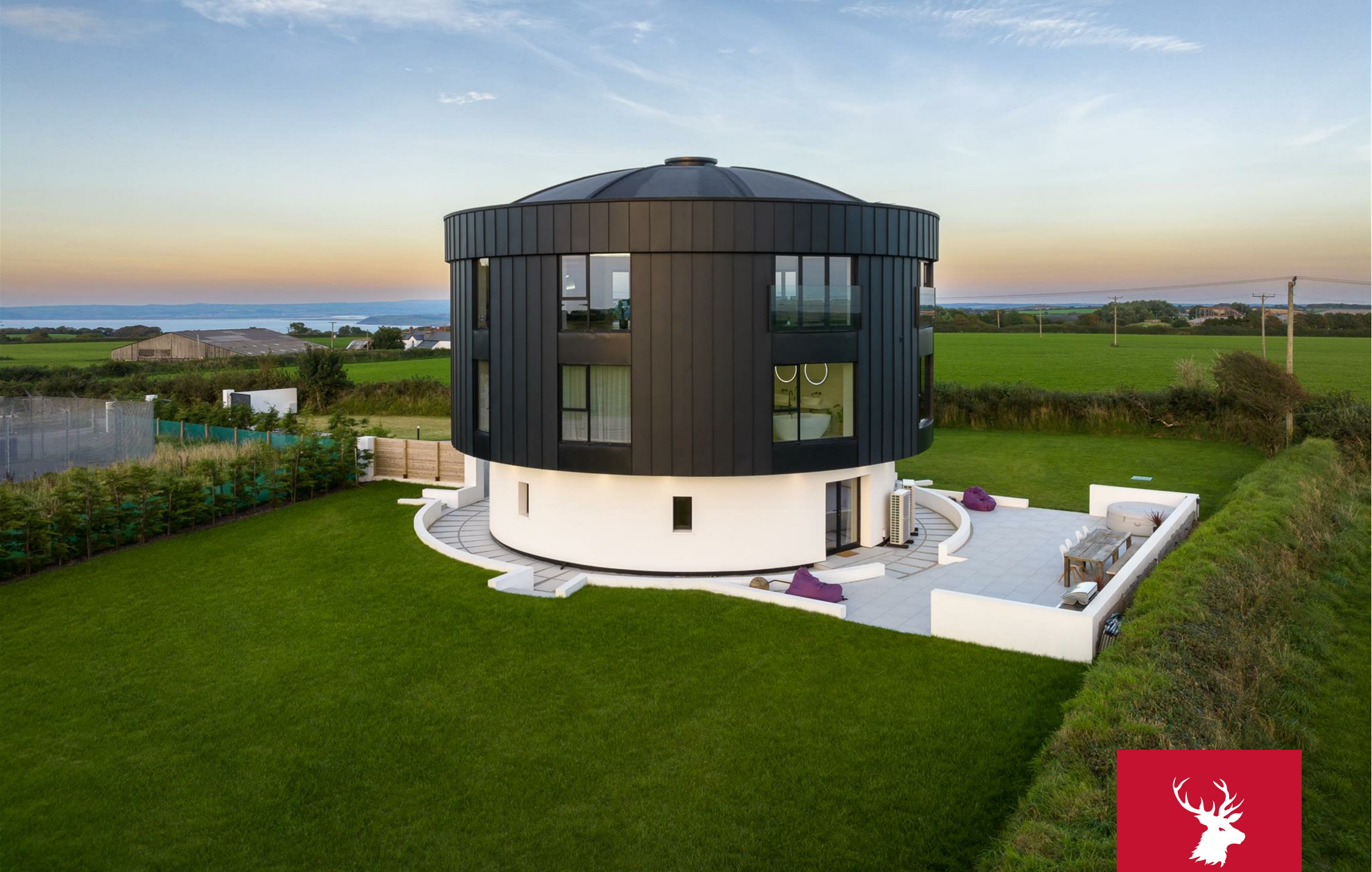
The Water Tower