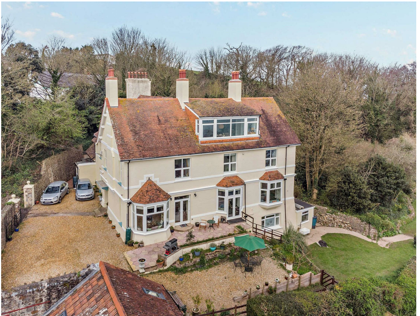
COMMS Appledore House