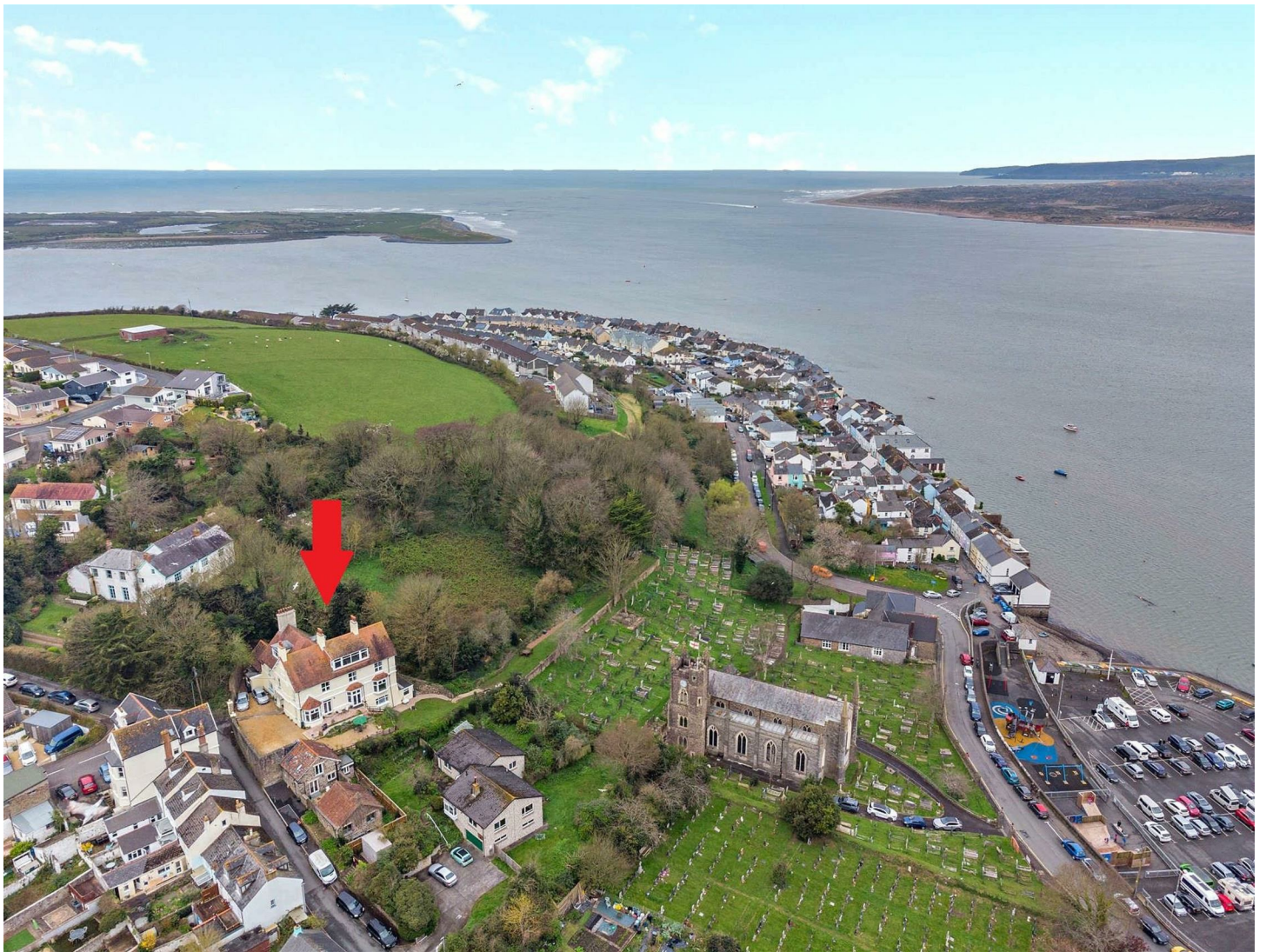
COMMS Appledore House