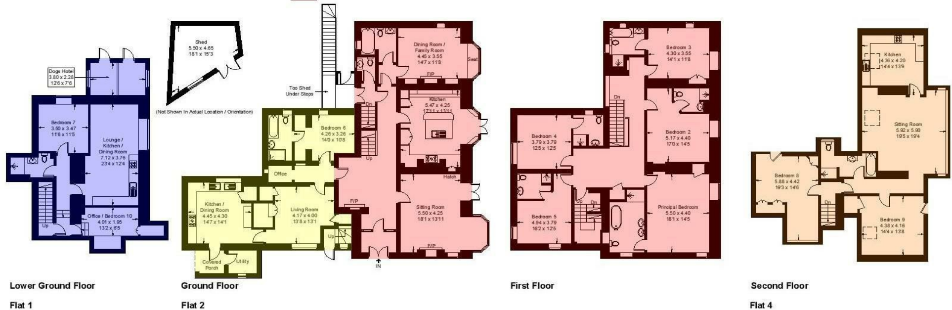
Illustration for identification purposes only, measurements are approximate, not to scale. (ID1153599)