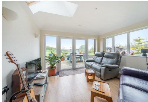
Bradworthy 3 miles, Woolsery 4 miles, Bideford 16 Miles

Detached period barn conversion situated in a tranquil rural location enjoying fabulous countryside views over its gardens