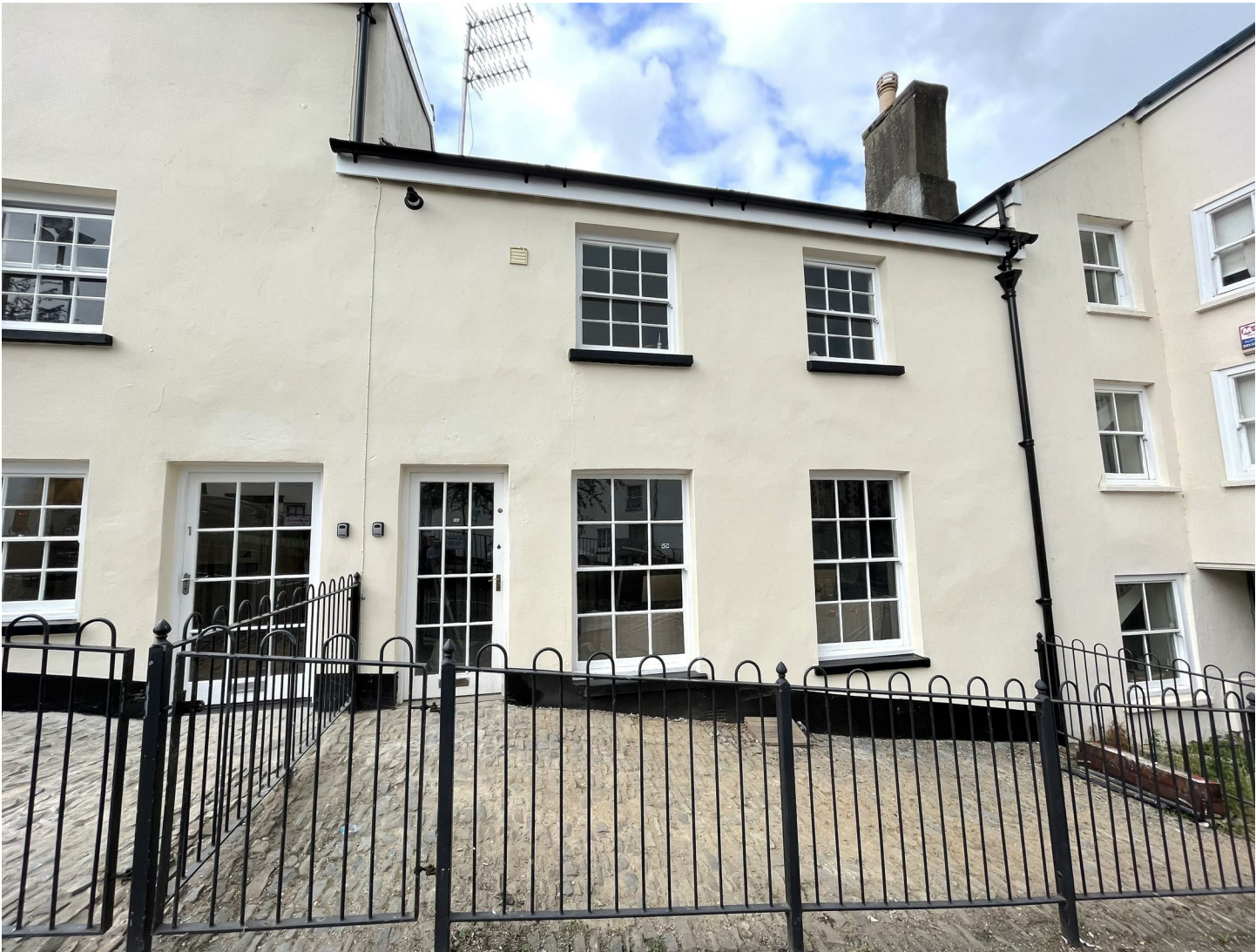
2 Bridge Chambers