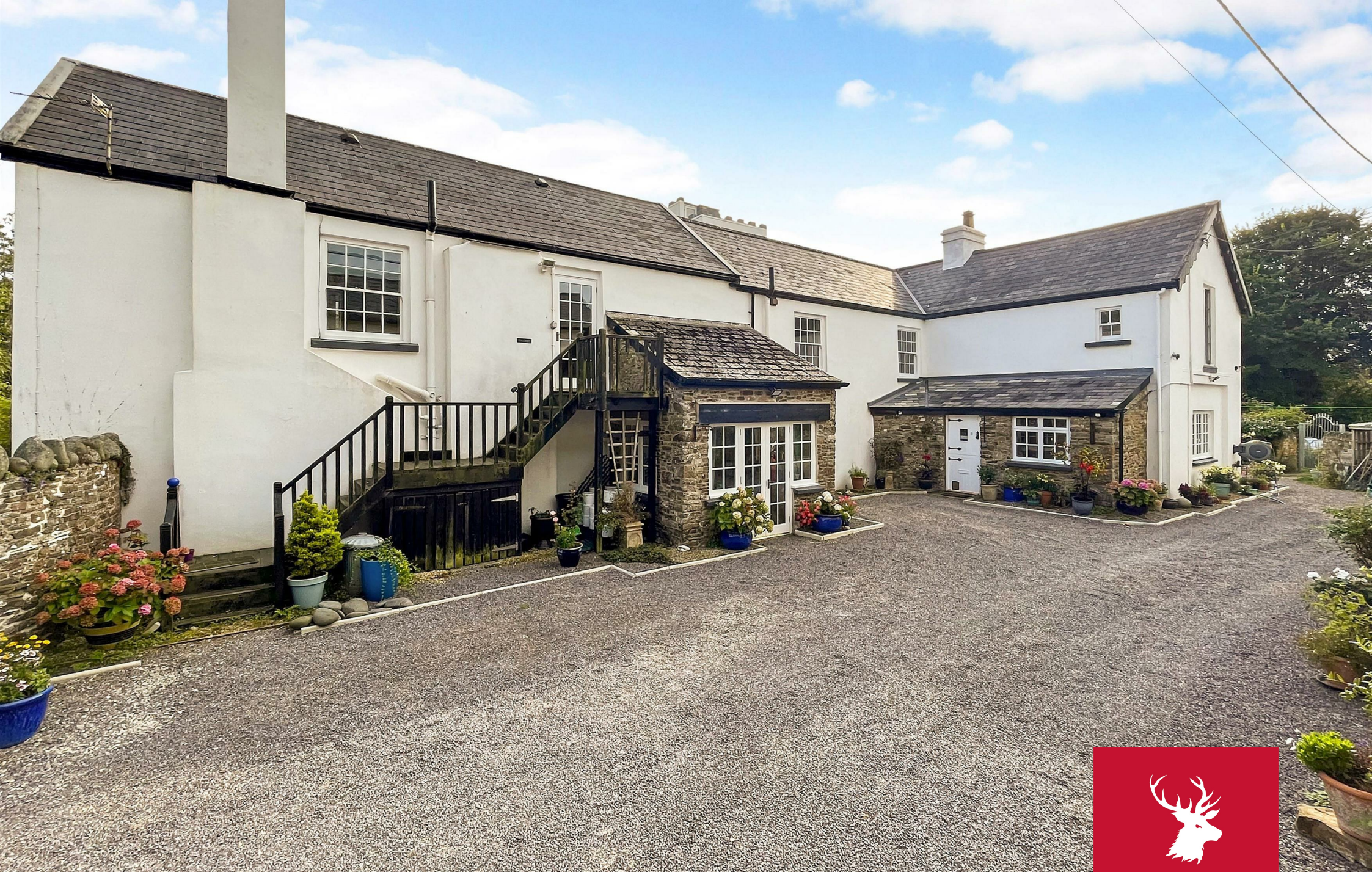
The Coach House