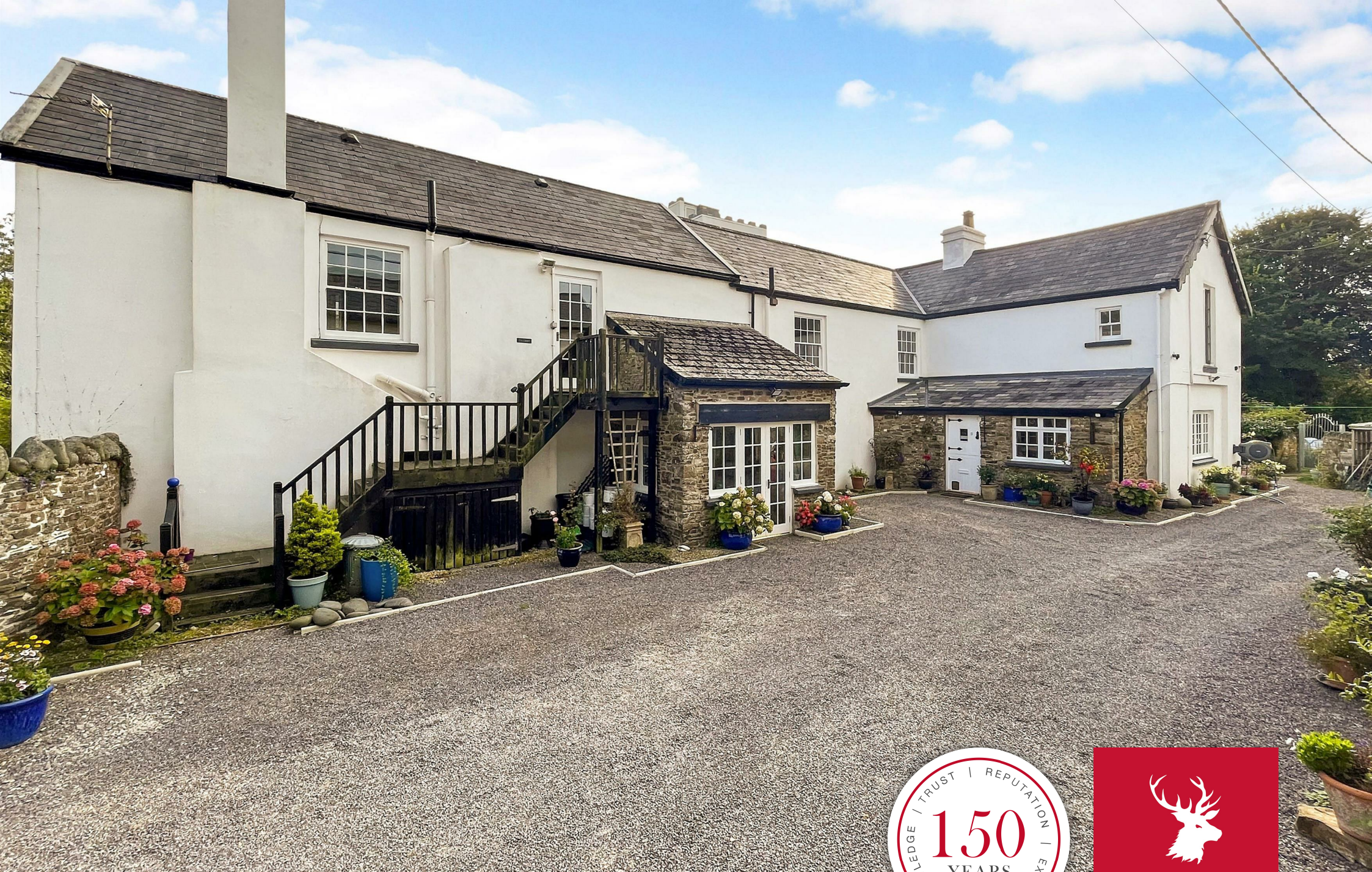
The Coach House