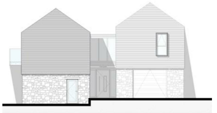
East Elevation 1:100