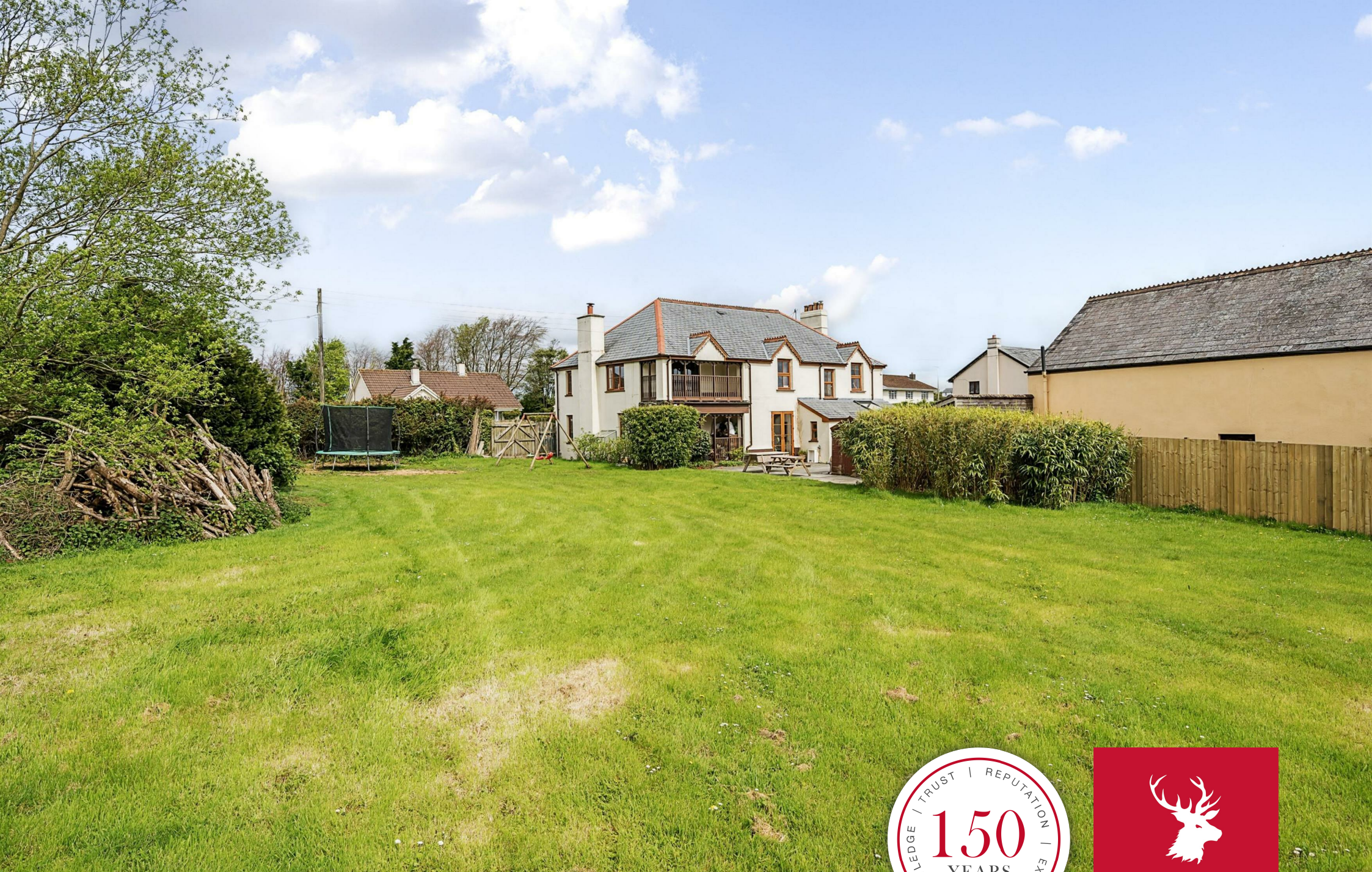
West End Villa