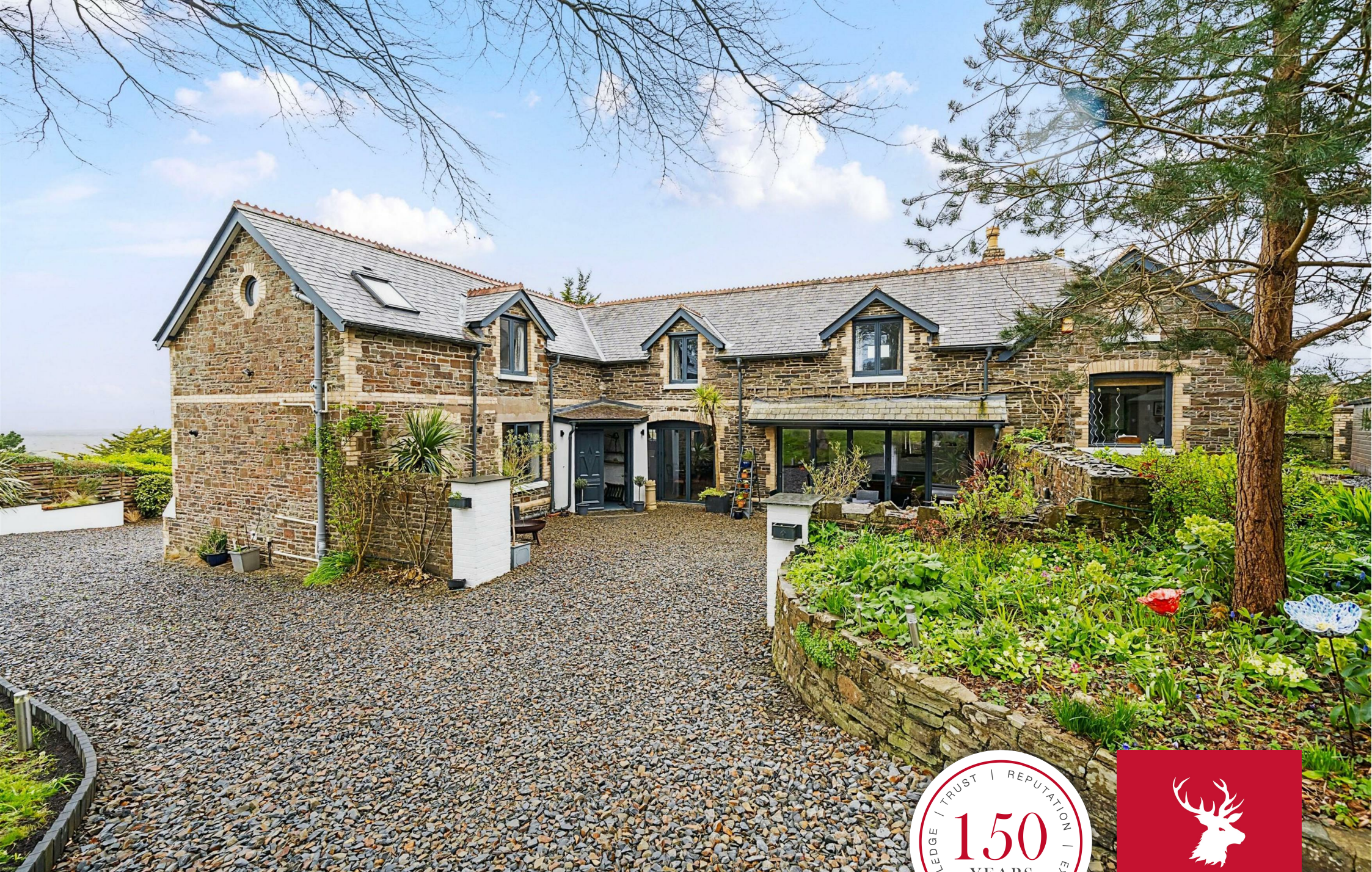
The Old Coach House