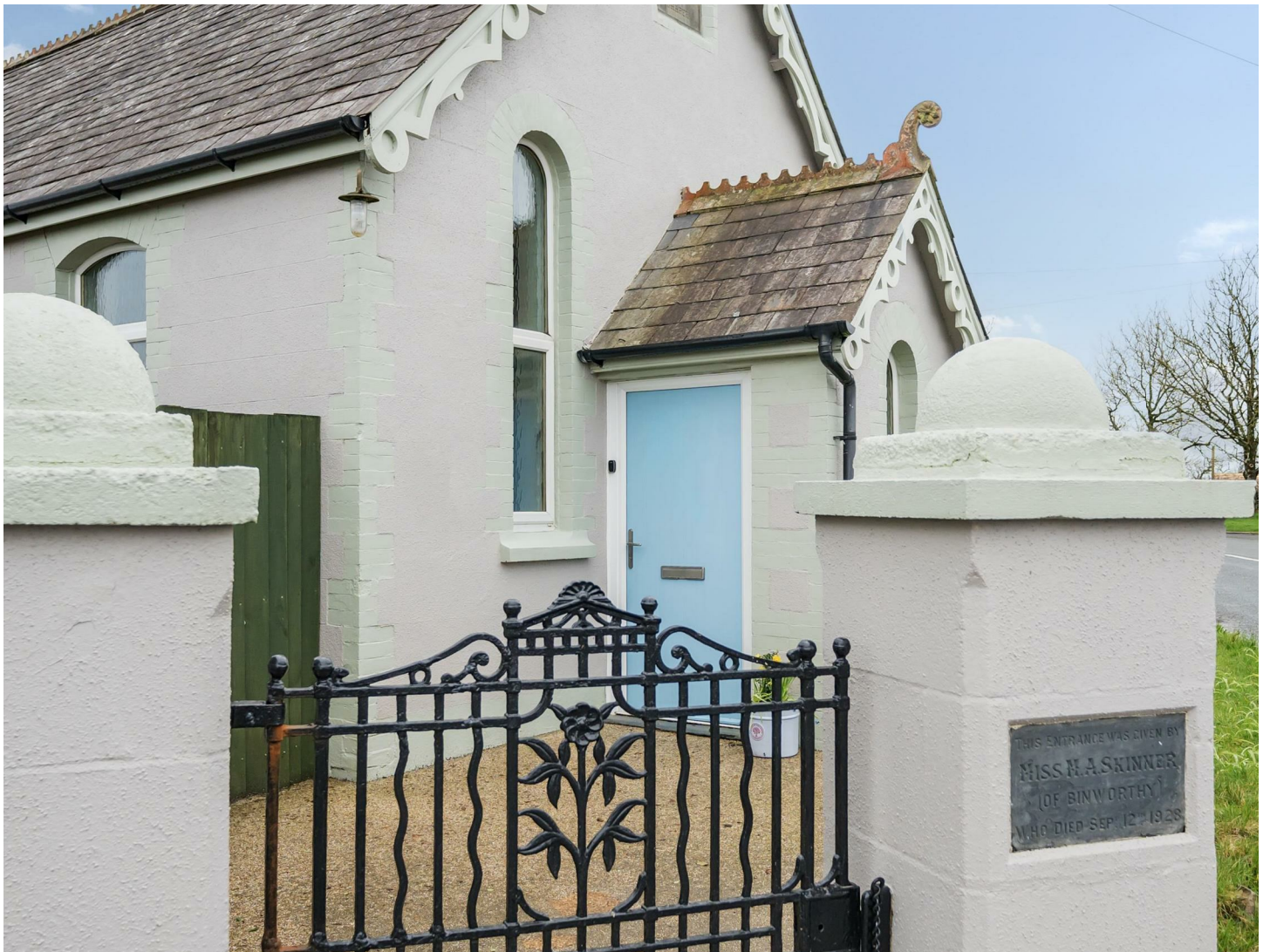
The Old Chapel