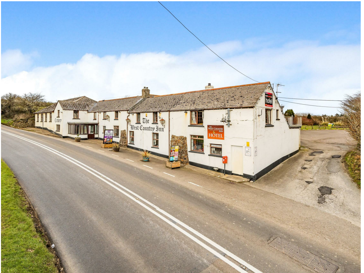
The West Country Inn