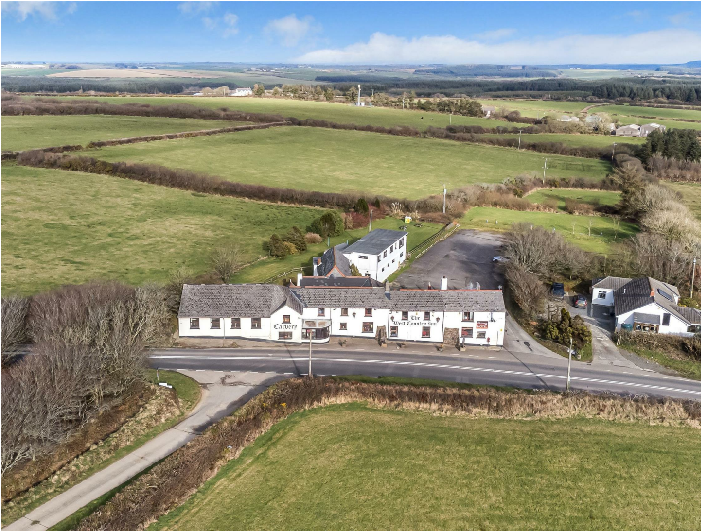
The West Country Inn