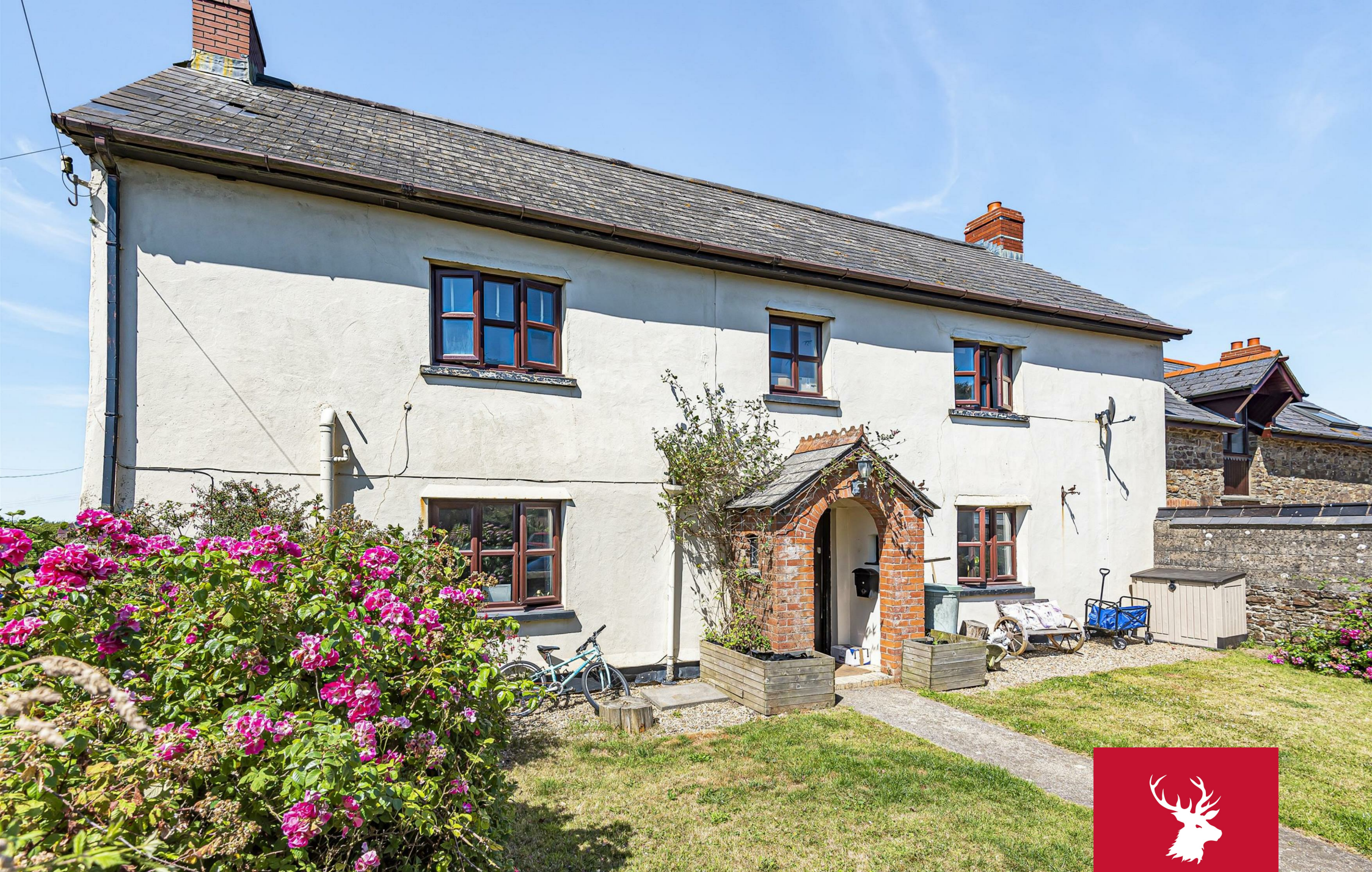
Southdown Farm House and Cottages