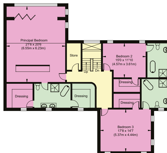
First Floor GROSS INTERNAL FLOOR AREA APPROX. 1774 SQ FT / 164.8 SQ M