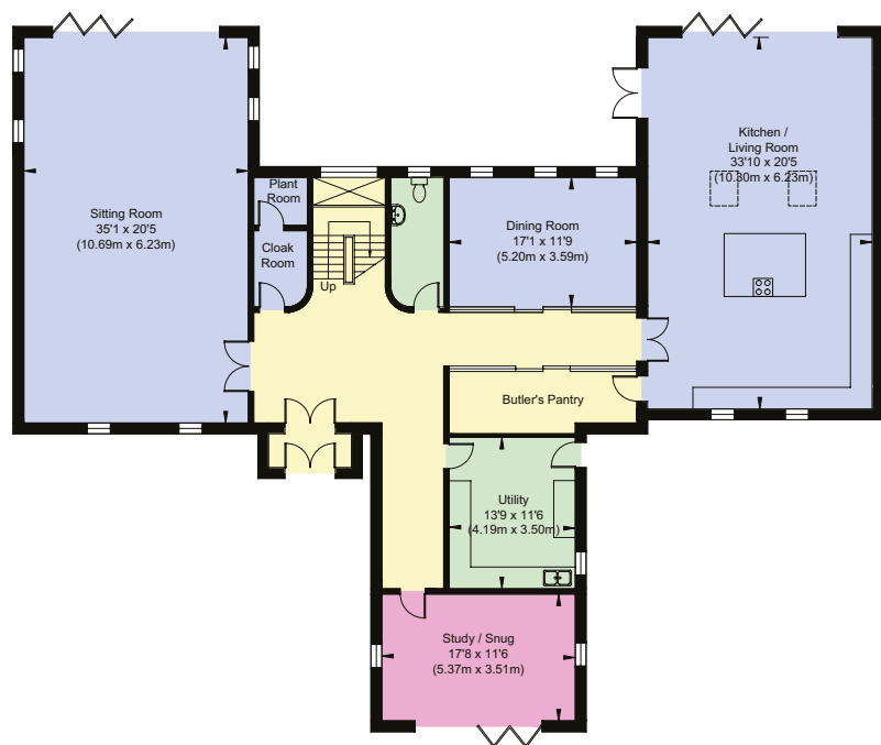
Ground Floor GROSS INTERNAL FLOOR AREA APPROX. 2729 SQ FT / 253.5 SQ M