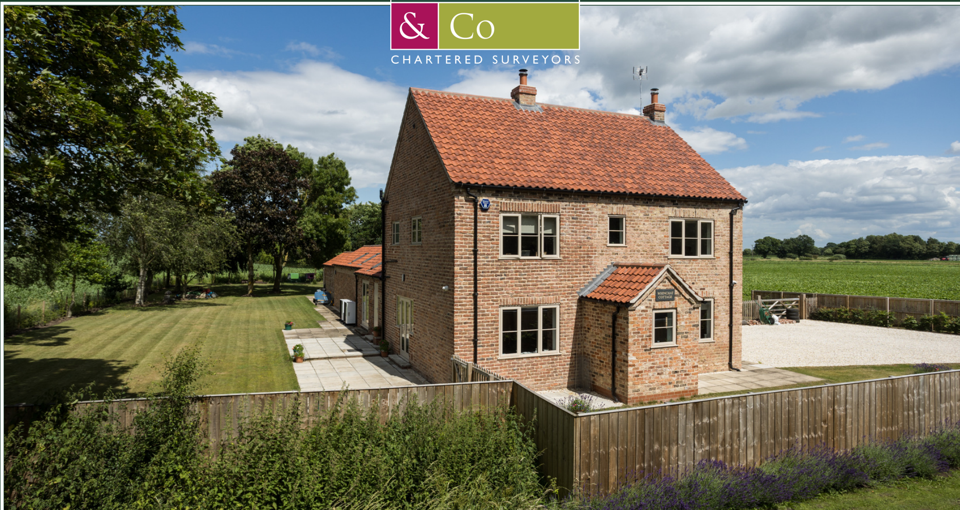
WHINCHAT COTTAGE · NORTH DUFFIELD · SELBY