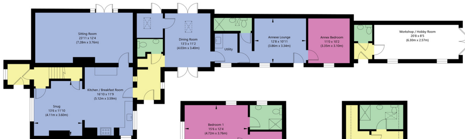
Ground Floor - (Excluding Workshop / Hobby Room) GROSS INTERNAL FLOOR AREA APPROX. 1486 SQ FT / 138.09 SQ M