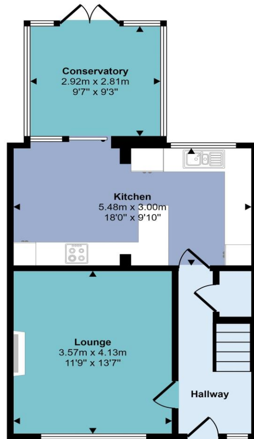
Ground Floor Approx 48 sq m / 522 sq ft

Approx Gross Internal Area 89 sq m / 956 sq ft