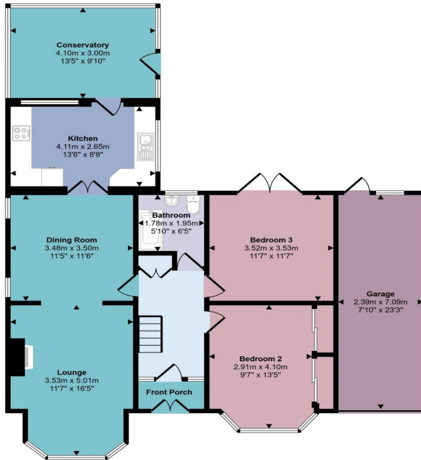
Ground Floor Approx 114 sq m / 1231 sq ft

Approx Gross Internal Area 145 sq m / 1566 sq ft