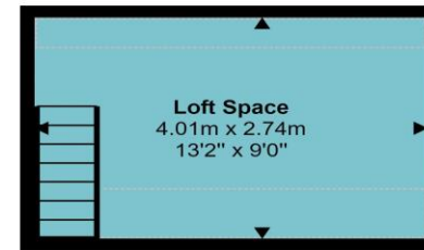
Second Floor Approx 11 sq m / 118 sq ft