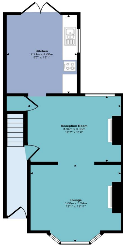
Ground Floor Approx 45 sq m / 480 sq ft

Approx Gross Internal Area 109 sq m / 1176 sq ft