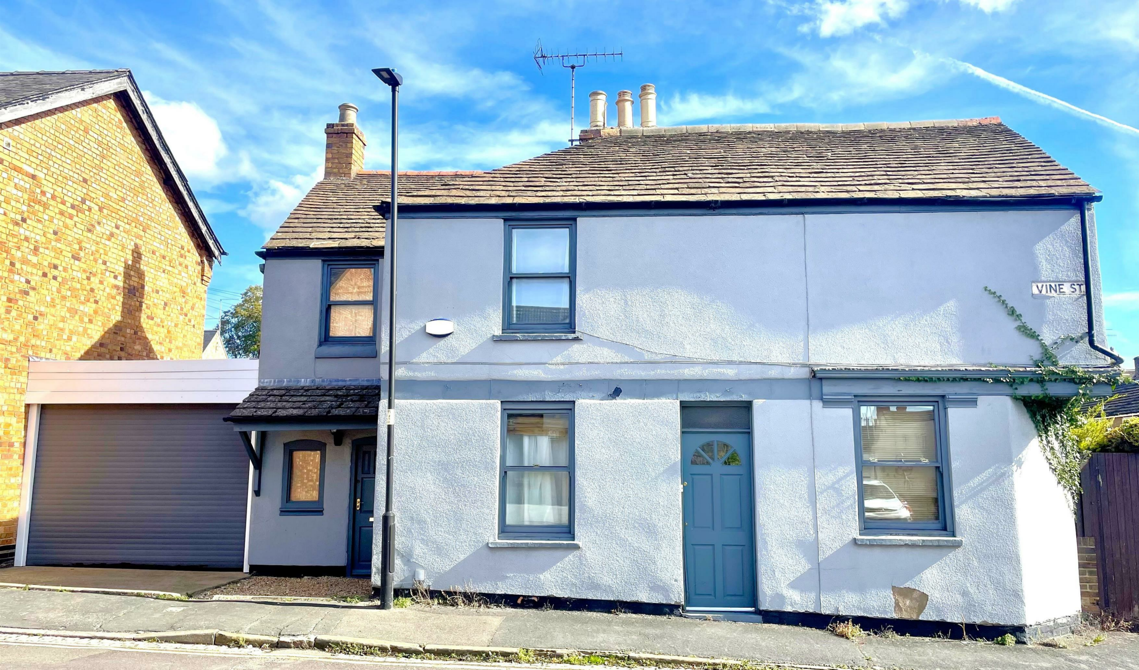
Vine Street Stamford, PE9 1QE £260,000