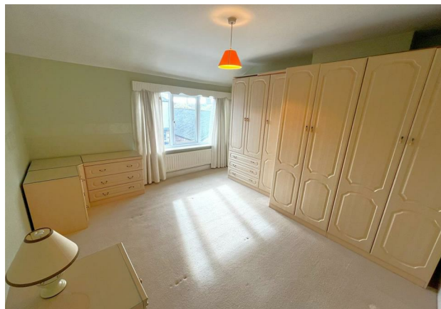
Bedroom 13'0" x 12'0" (3.98m x 3.67m)