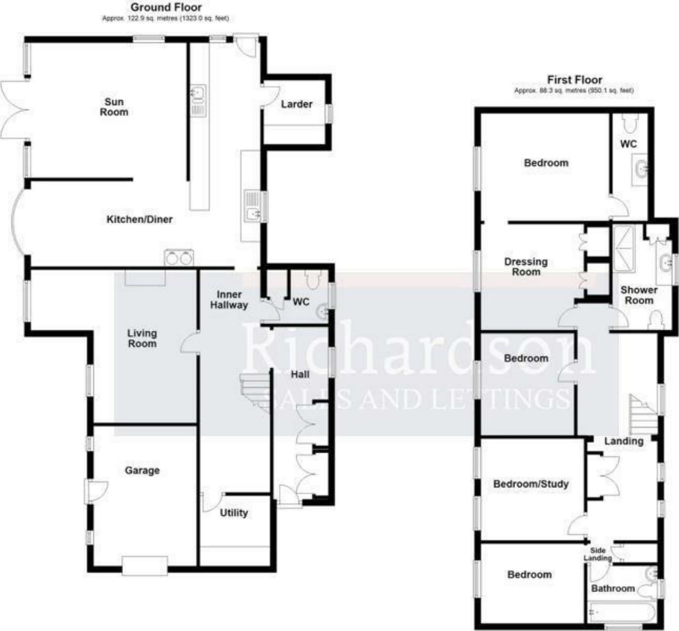
Total area: approx. 211.2 sq. metres (2273.1 sq. feet) Ivy Cottage Mill Lane, Tallington