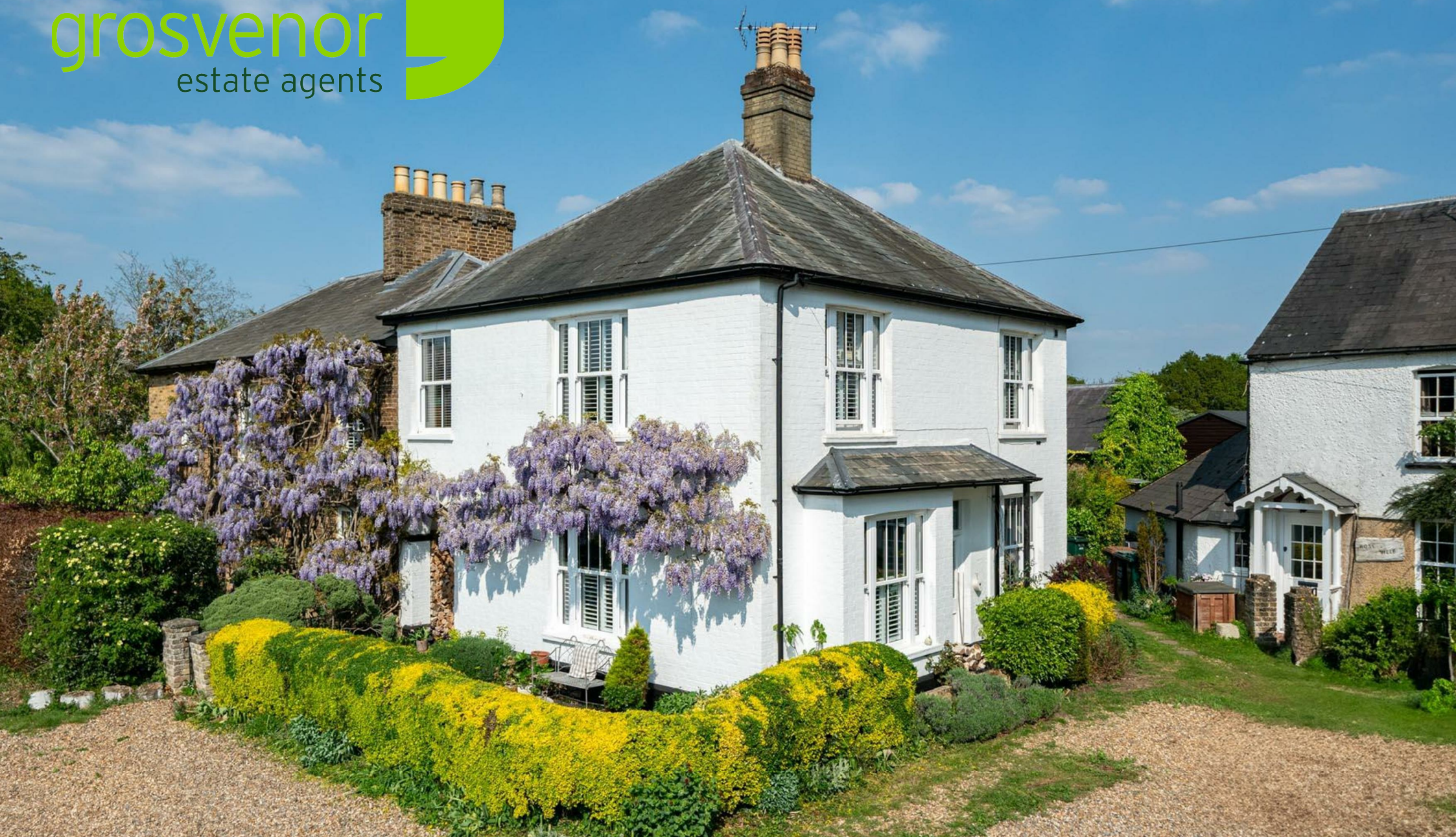
Fernley House The Green, Croxley Green, WD3 3HT Price Guide £1,150,000