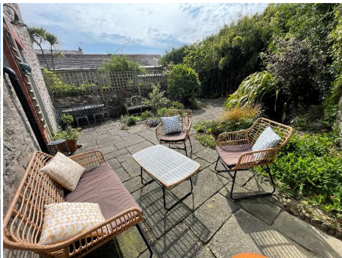
FRONT ELEVATION AND PRIVATE REAR GARDEN