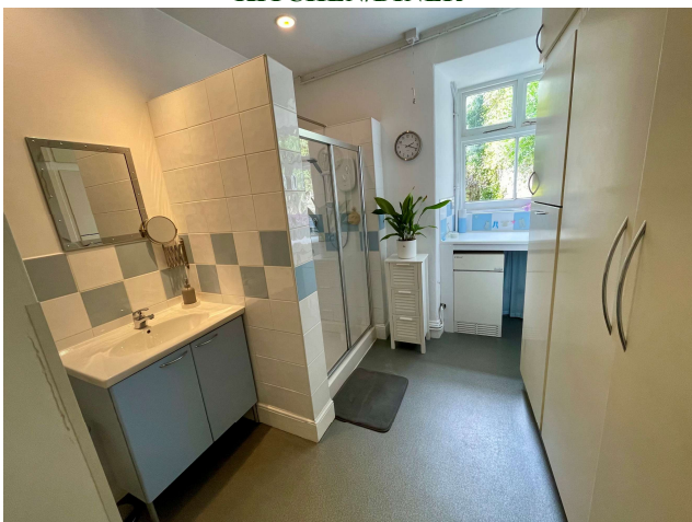
GROUND FLOOR UTILITY/SHOWER ROOM