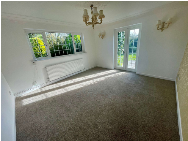
RECEPTION ROOM/BEDROOM FOUR