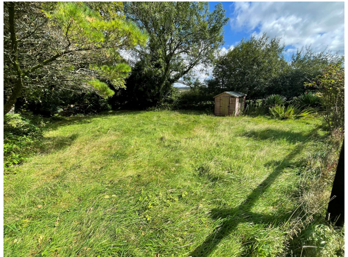
SEPARATE GARDEN AREA