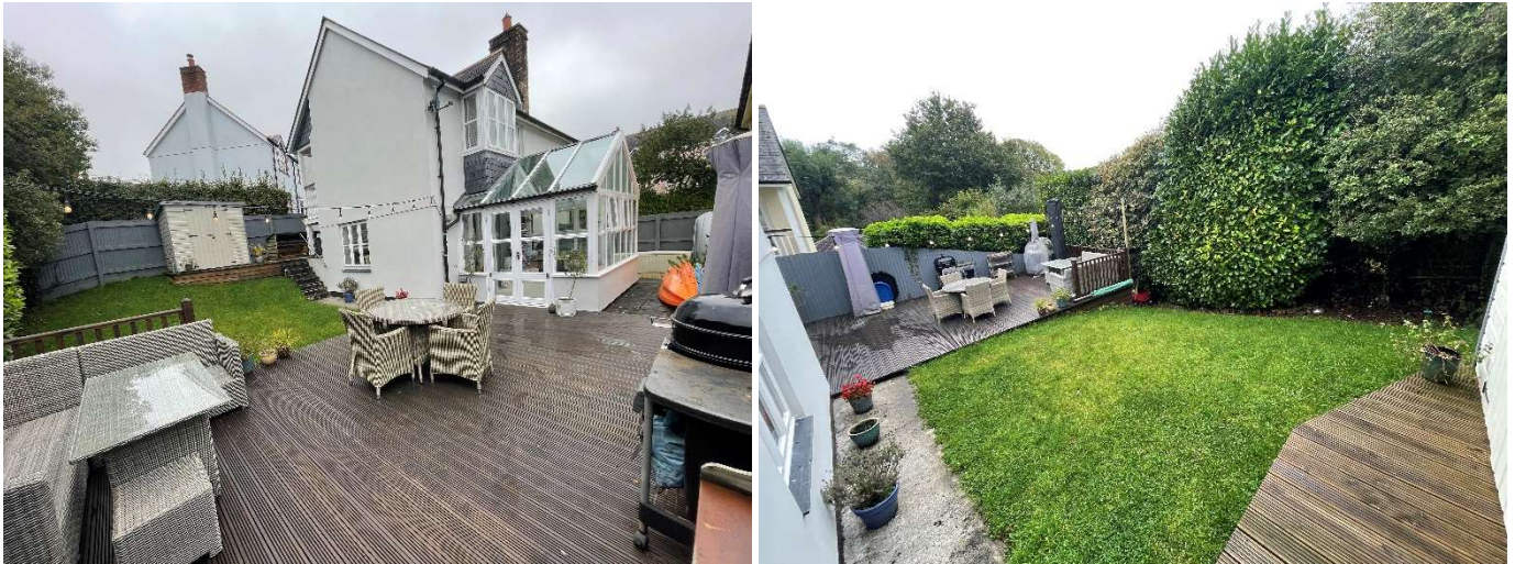
REAR GARDEN AND LARGE DECKING AREA