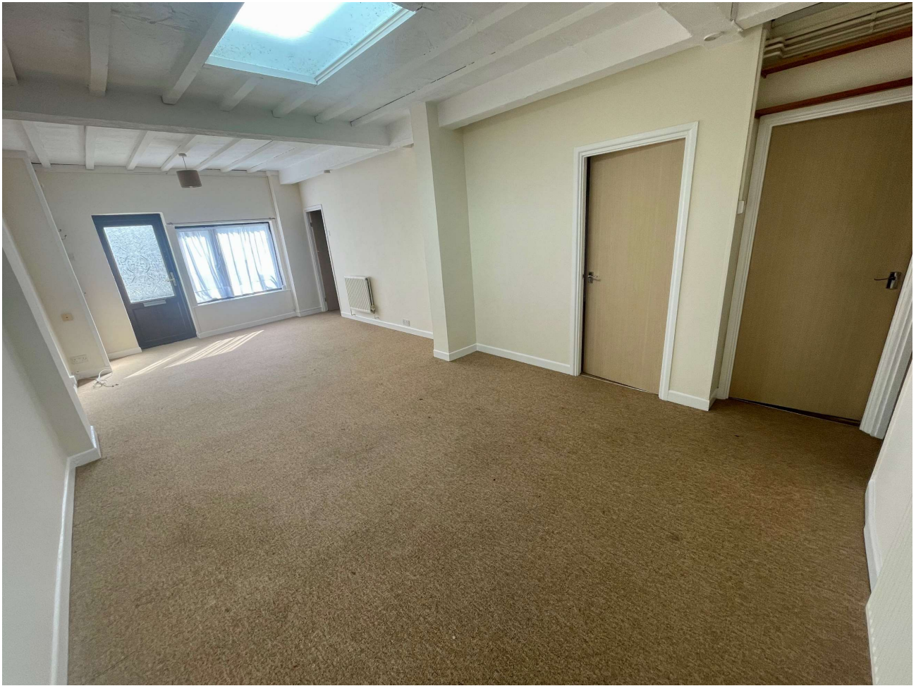
OPEN PLAN LOUNGE/DINING ROOM