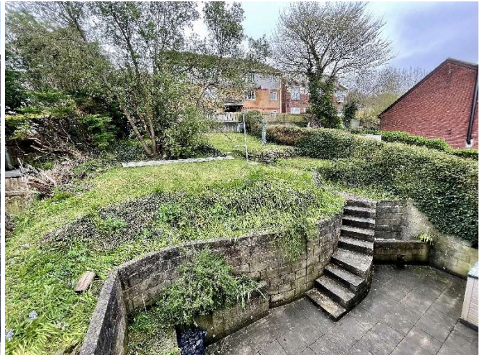
FRONT ELEVATION AND OVERVIEW OF REAR GARDEN