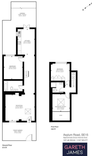
Illustration for identification purposes only. Not to scale. Floor Plan Drawn According To RICS Guidelines.