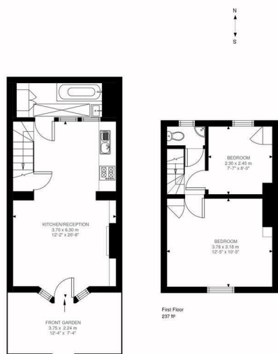
Ground Floor 297 sq ft