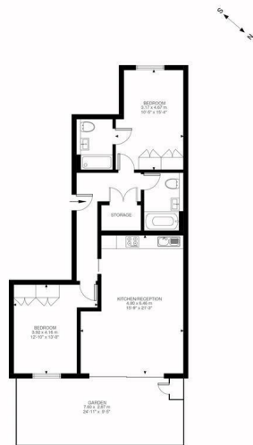
Ground Floor 841 SF

Sumner Road, SE15 Approximate Gross Internal Area 78.10 SQ.M / 841 SQ.FT