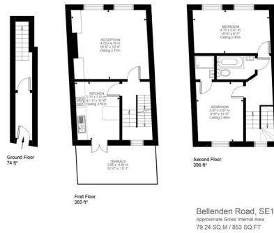
Illustration for identification purposes only. Not to scale. Floor Plan Drawn According To NCCP Guidelines.