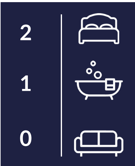
Illustration for identification purposes only. Not to scale. Floor Plan Drawn According To NCCP Guidelines.

Denman Road, SE15 Approximate Gross Internal Area 103.32 SQ.M / 1112 SQ.FT