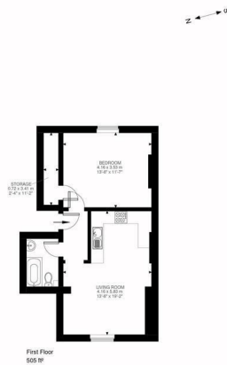
First Floor 505 sq ft

Coleman Road, SE5 Approximate Gross Internal Area 46.88 SQ.M / 505 SQ.FT