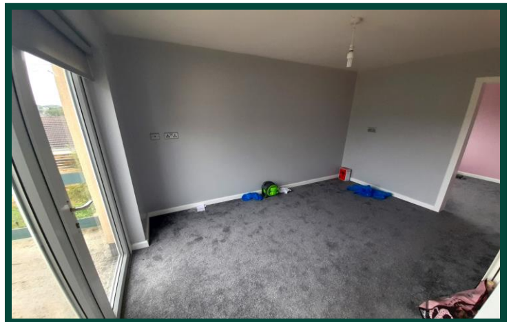
Bedroom 2 (Extension)