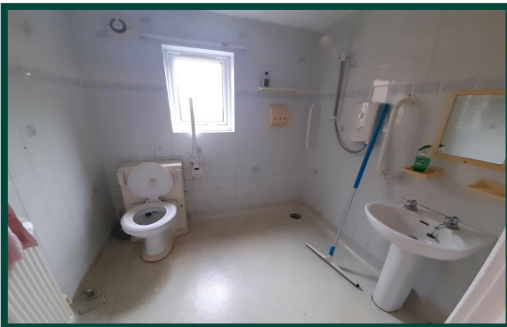
Wet Room (Extension)