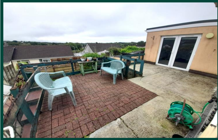
Patio Seating Area