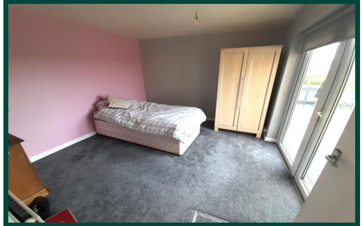
Bedroom 1 (Extension)