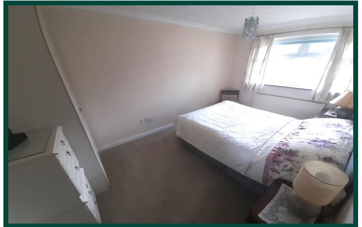
Bedroom to Rear