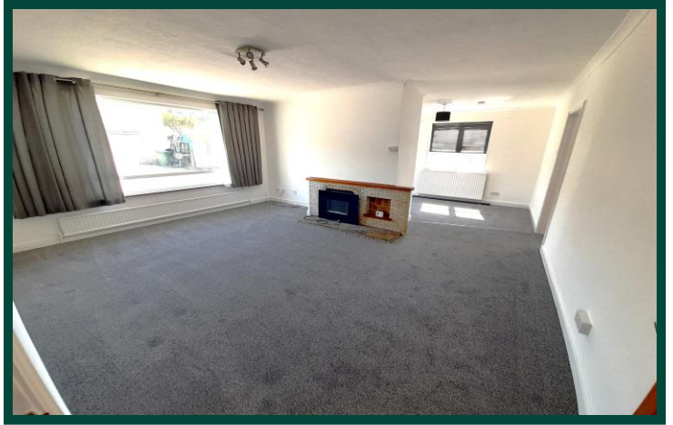
Lounge into Dining Room