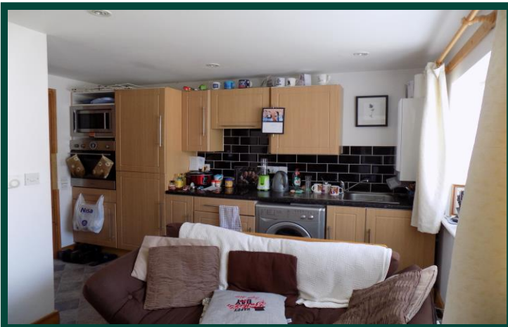
Annexe Open Plan Living