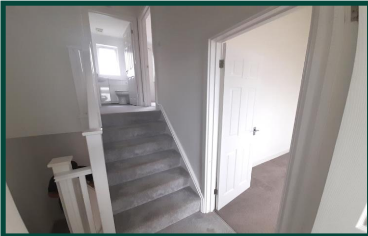
Half Landing to Top Floor