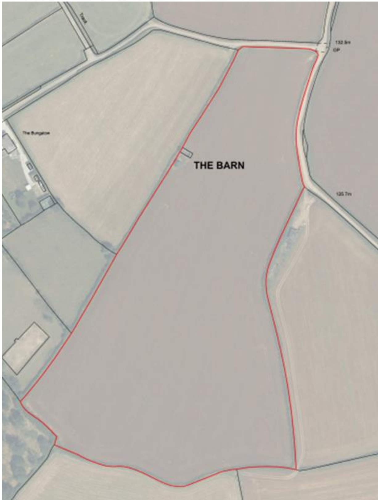
Plan not to scale