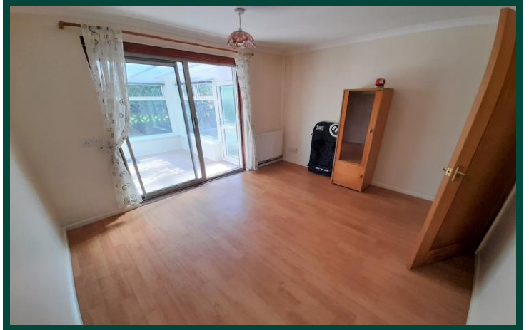
Bedroom / Reception 2