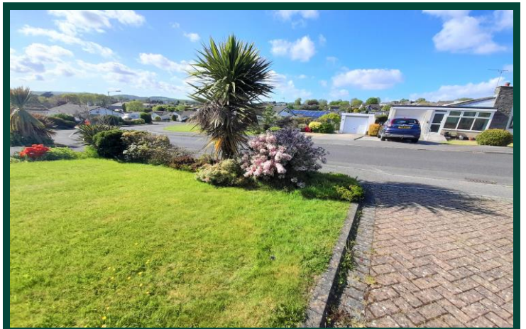
View from the Drive