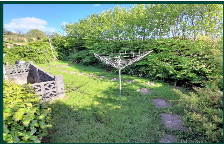
Rear Garden with Open Fields Beyond