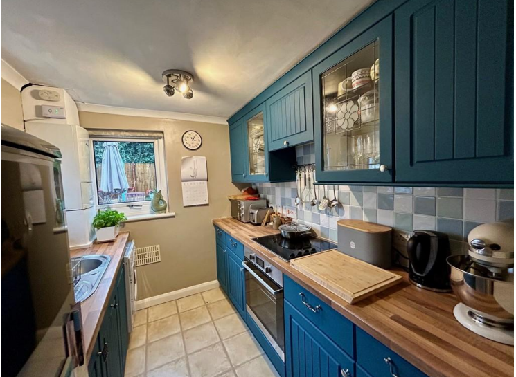
29 St. James Road, Carshalton, SM5 2DT | Guide Price £435,000 Freehold

A beautifully presented 2 bedroom cottage located in a popular road close to shops and bus routes. The property is within walking distance of shopping parades, restaurants and Carshalton mainline station. The area is alsowell served with a good selection of leisure facilities, fantastic parkland and open spaces. The more comprehensive shopping facilities of Sutton town centre are a bus ride or short drive away. No Chain.