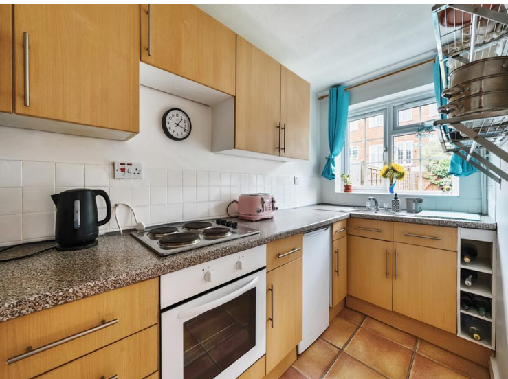
61 Bucklers Way, Carshalton, SM5 2DZ | Guide Price £465,000 - £475,000 Freehold

This charming three-bedroom mid-terrace house offers modern living in a central Carshalton location. The property features a spacious living room and a separate, well-appointed kitchen, perfect for both entertaining and family life. Upstairs, you will find three generously sized bedrooms and a family bathroom. The landscaped garden provides a private outdoor space, while the integral garage offers the potential for conversion, subject to planning permission (STPP).