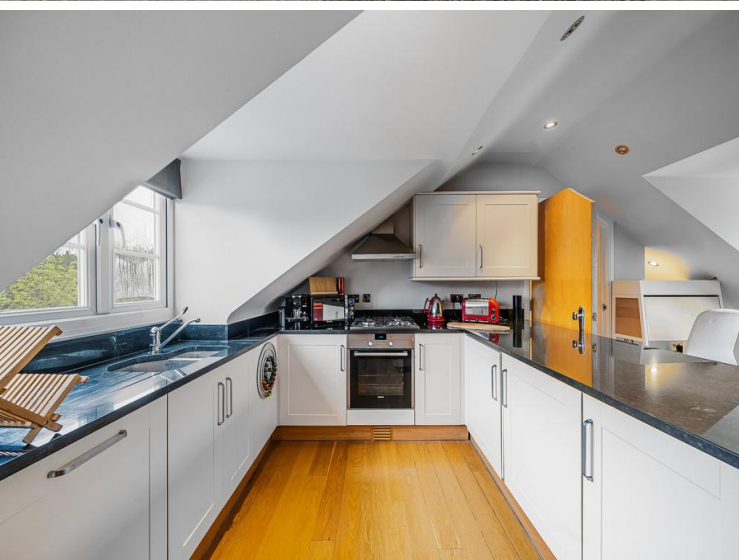
66A Beechwood Court, West Street Lane, Carshalton, SM5 2QA | Guide Price £325,000 Leasehold

A well presented, bright and spacious 2 bedroom, 2 bathroom top floor apartment set within a highly sought after private gated development located in the heart of Carshalton Village. The property offers spacious open plan accommodation and features include a modern kitchen with integrated appliances, an en-suite bathroom to the bedroom one and an additional bathroom. Grove Park, Carshalton High Street as well as Carshalton mainline station and bus routes are all within walking distance.