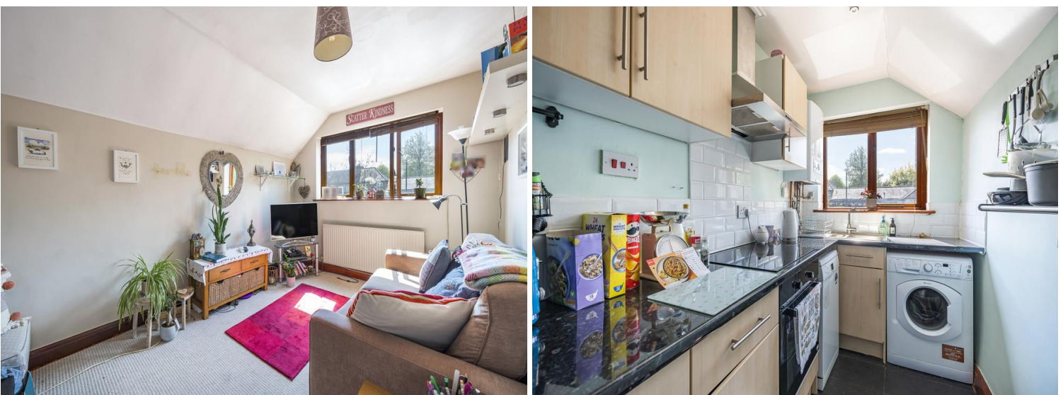
Flat 2, 18-20 High Street, Carshalton, SM5 3AG | Guide Price £300,000 Leasehold

Situated in the heart of Carshalton Village, this two bedroom apartment benefits from gas central heating, allocated parking, and a private decked terrace. The property is a short walk from Carshalton High Street, Westcroft Leisure Centre and Carshalton Mainline Station.