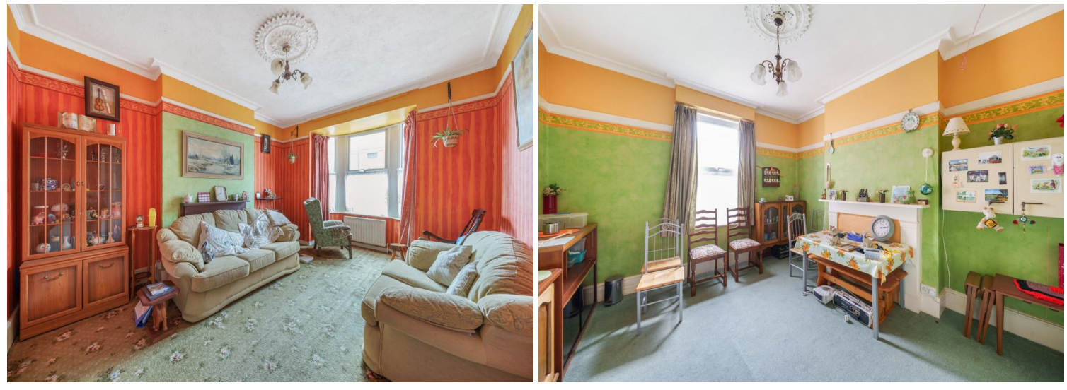
28 West Street, Carshalton, SM5 2QG | Guide Price £650,000 Freehold

Discover the charm of Carshalton Village with this perfectly located 4 bedroom Victorian terrace house on West Street. Nestled in the heart of the historic and picturesque village, this property offers an exceptional opportunity to create your dream home.